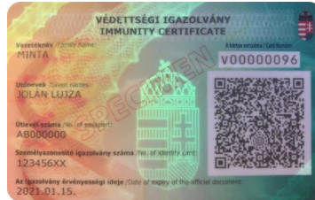
Hungarian COVID-19 Immunity Certification Card

In Hungary, the so-called protection certificate, the production, personalization, and mailing is carried out by ANY Security Printing Company, based in Budapest. Every card is personalized and protected by a “patented IQ-R technology” which can only be authenticated using a Government approved mobile app.